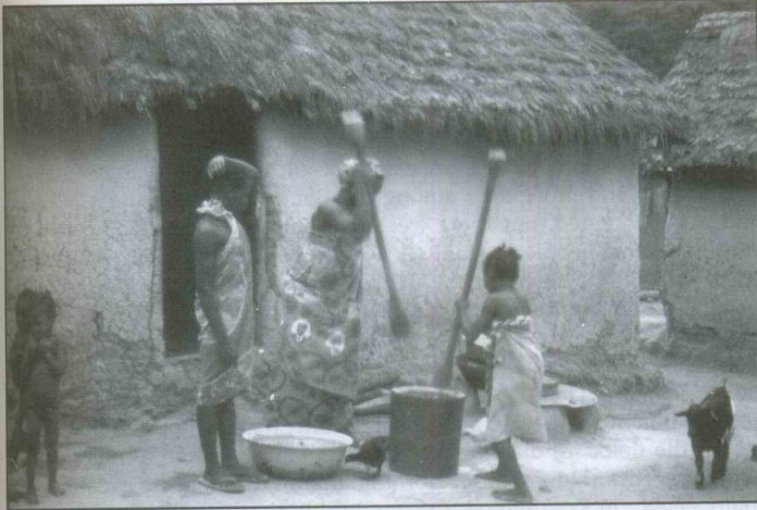
Mother and daughter pound food in a mortar.

village. When the elders stopped the music briefly to bless us ritually, Alma and I felt a bit closer to that elusive acceptance we'd always craved, and we felt that we had somehow come full circle: by distributing the proceeds of our book about Beng culture, we had not only adopted Beng notions of obligation and generosity, we had further entered into the culture's logic, discovering value not only in typical development projects easily approved by U.S. Embassy officials, but also in projects that offered benefits that were more sociological and psychological than economic . . . but whose effects were no less tangible.