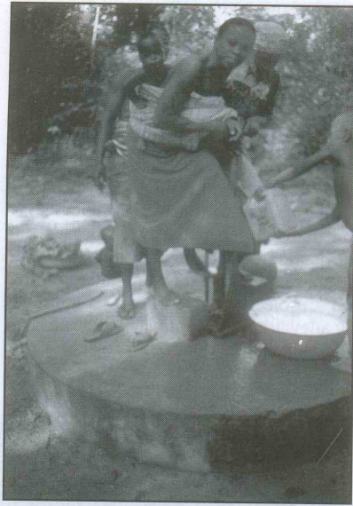
Girl works her village's water pump.

aspects of their personalities, not given them enough weight in our portrayals? Oh, the curse of a writer, endlessly revising. . . .