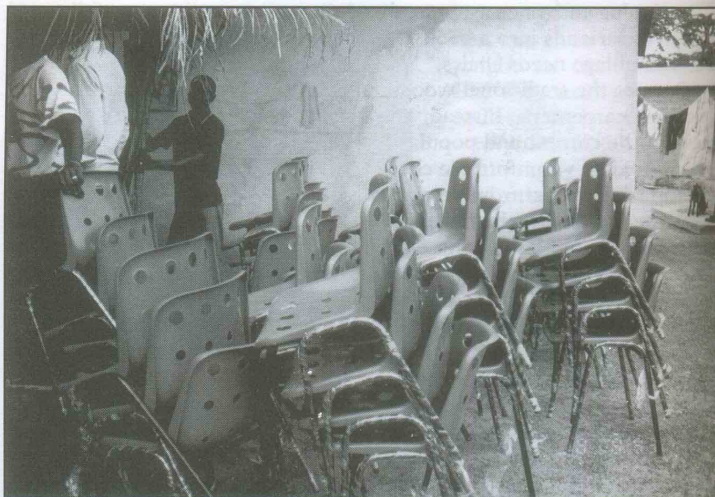
Fifty blue plastic chairs stacked up in the public plaza of Kosangbe upon presentation to the village.

larger towns and cities. It had become difficult to persuade a family from another village to offer a daughter in marriage to a Kosangbe man, for such a young woman would have to move to a tiny, backward place—even if it was the most powerful of all Beng villages, ritually speaking.